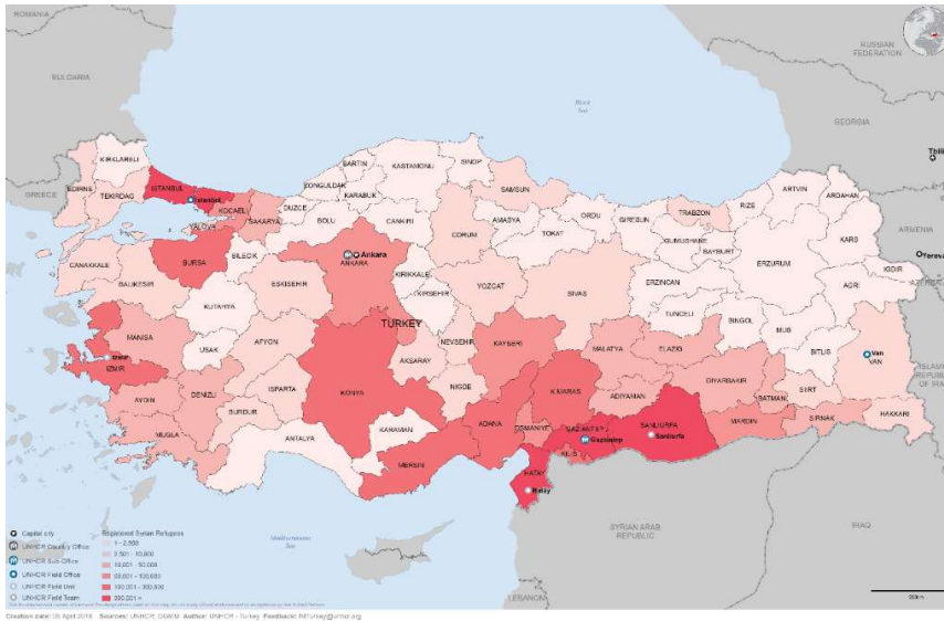
Figure 1: Provincial breakdown of Syrian refugees in Turkey 2018 (UNHCR, DGMM)

of the art focusing on ethical concerns and major methodological challenges which emerged as crucial for the project. The third section describes our methodological approach in detail, followed by reflections from members of the local teams.